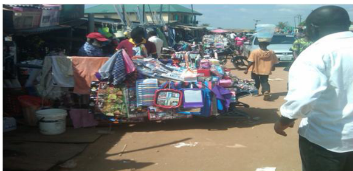
Plate 1. Encroachment on Roads by Street Traders in Port Harcourt City

Table 4 indicates that almost half of the refuse generated by street are disposed of by burning, followed by dumping in drainage which is 31.68% and dumping on ground which causes serious air pollution, breed mosquitoes and depredate the environment and this demand for proper methods of waste disposal.