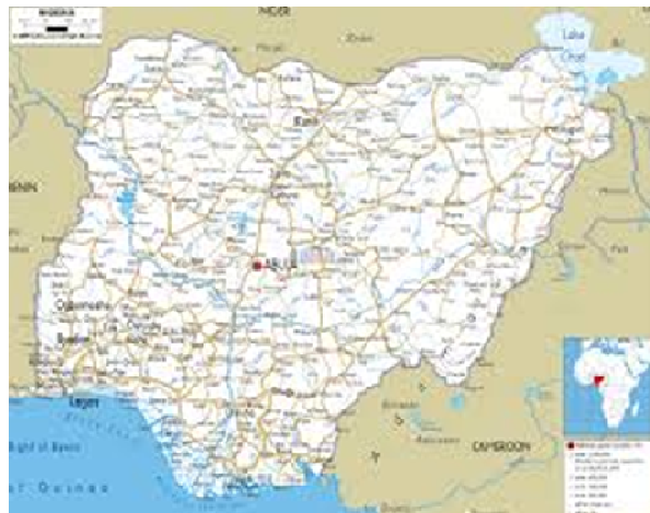
Figure 1. Map of Nigeria