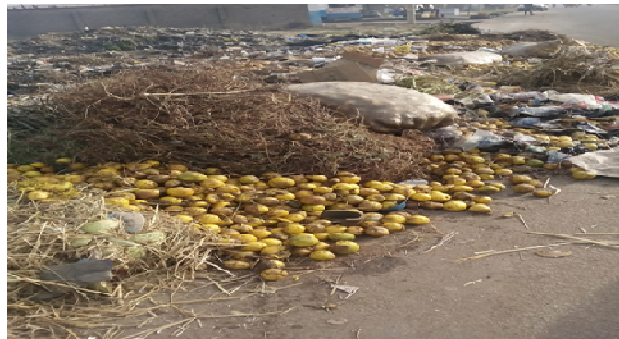
Plate 2. Environmental pollution caused by dumping of refuse by the roadside

principles where land use are meant to complement each other than intruding into another the by reducing the efficiency of the road and also causing competition of space between land uses